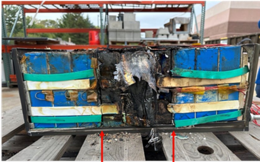
GORE Battery Insulation placement